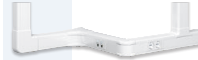
■ White snap-on trunking, p. 747