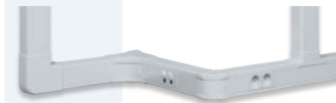
■ Grey snap-on trunking, p. 750