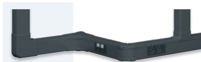
■ Black edition snap-on trunking, p. 745